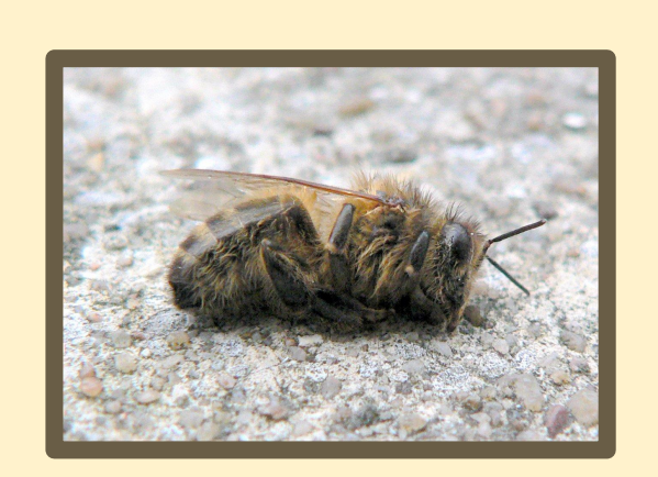
In Earth Science: